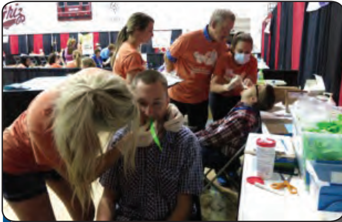
Special Olympics Athletes are ready to compete and equipped with new mouth guards, thanks to dental volunteers.

Local dentists, dental hygienists, dental assistants and students help fit competitors with mouthguards.