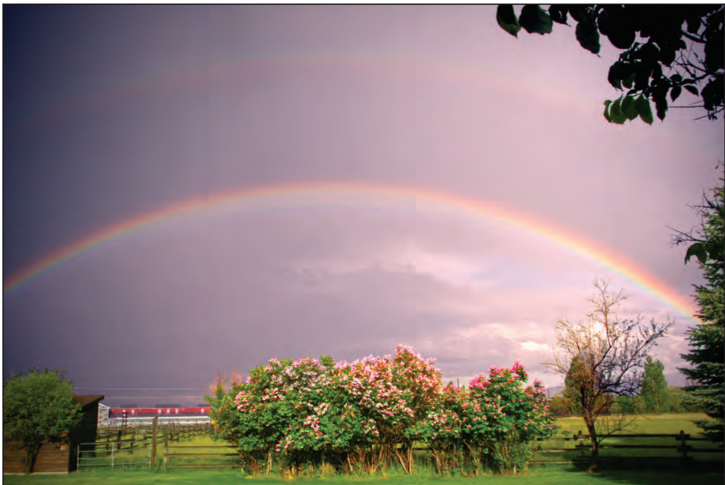
Rainbow over Helena