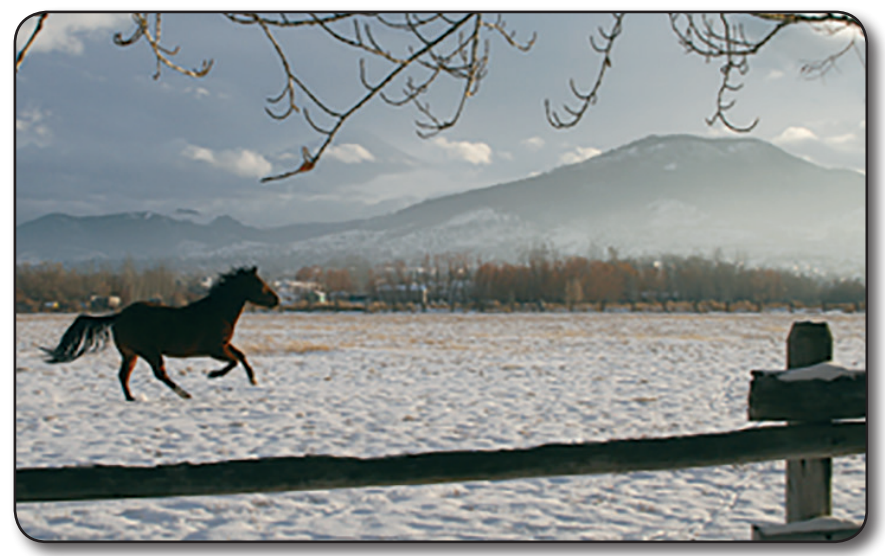
Helena Valley.