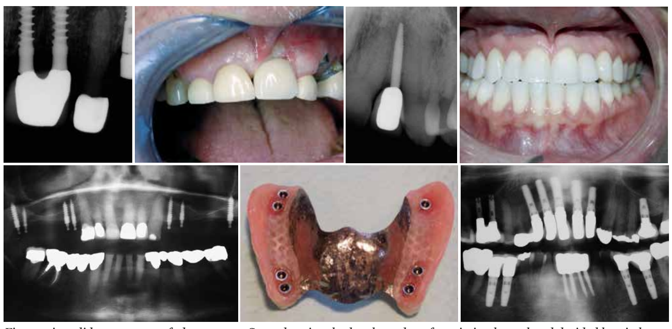
First patient did not want graft due to costs. Second patient had ortho redone for missing lateral and decided late in her treatment that she did not want a bridge (In place 8+ years). Third patient age 87 and partial would not stay in well and was damaging abutment teeth. No clasps needed now. Last, patient wanted to get rid of his partials, we placed a mix of implants to match bone widths (10 years since placed).

Because I have been placing MDIs for over 14 years, I know they work very well long term; in my experience success rates are similar to standard implants. I would encourage those interested to request MDIs be placed by someone experienced with placing implants, or take good courses, and begin placing them yourselves. Call me if you would like more information.