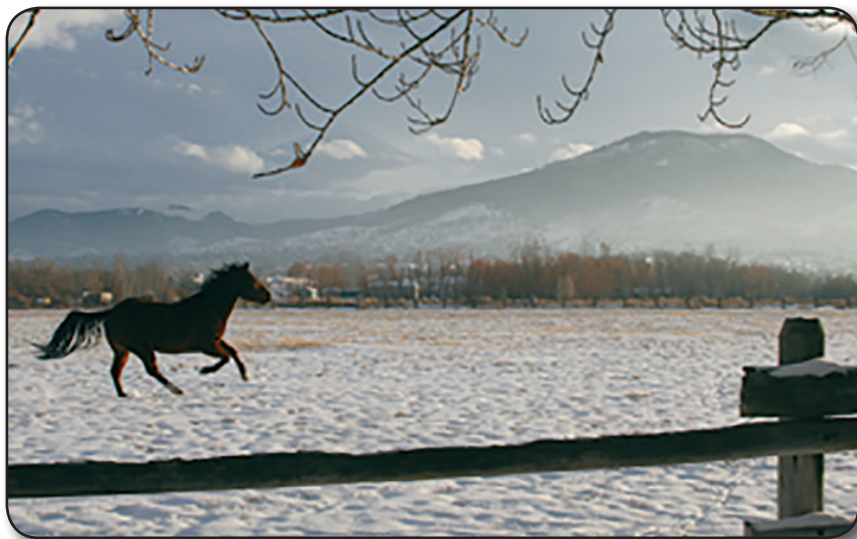
Helena Valley.