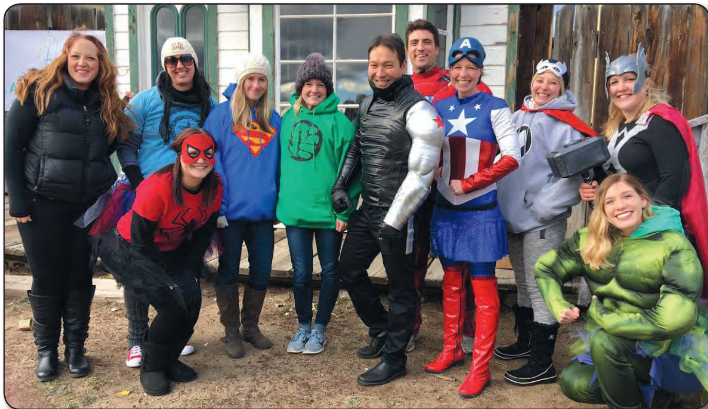
Treat Street! Superheros from the offices of Butte Pediatric Dentistry, Andrews Orthodontics and Laslovich Orthodontics handed out toothbrushes, toothpaste and glow-in-the-dark vampire teeth at Butte's Halloween "Treat Street." More than 2,700 trick or treaters participated in the annual event at the World Mining Museum.