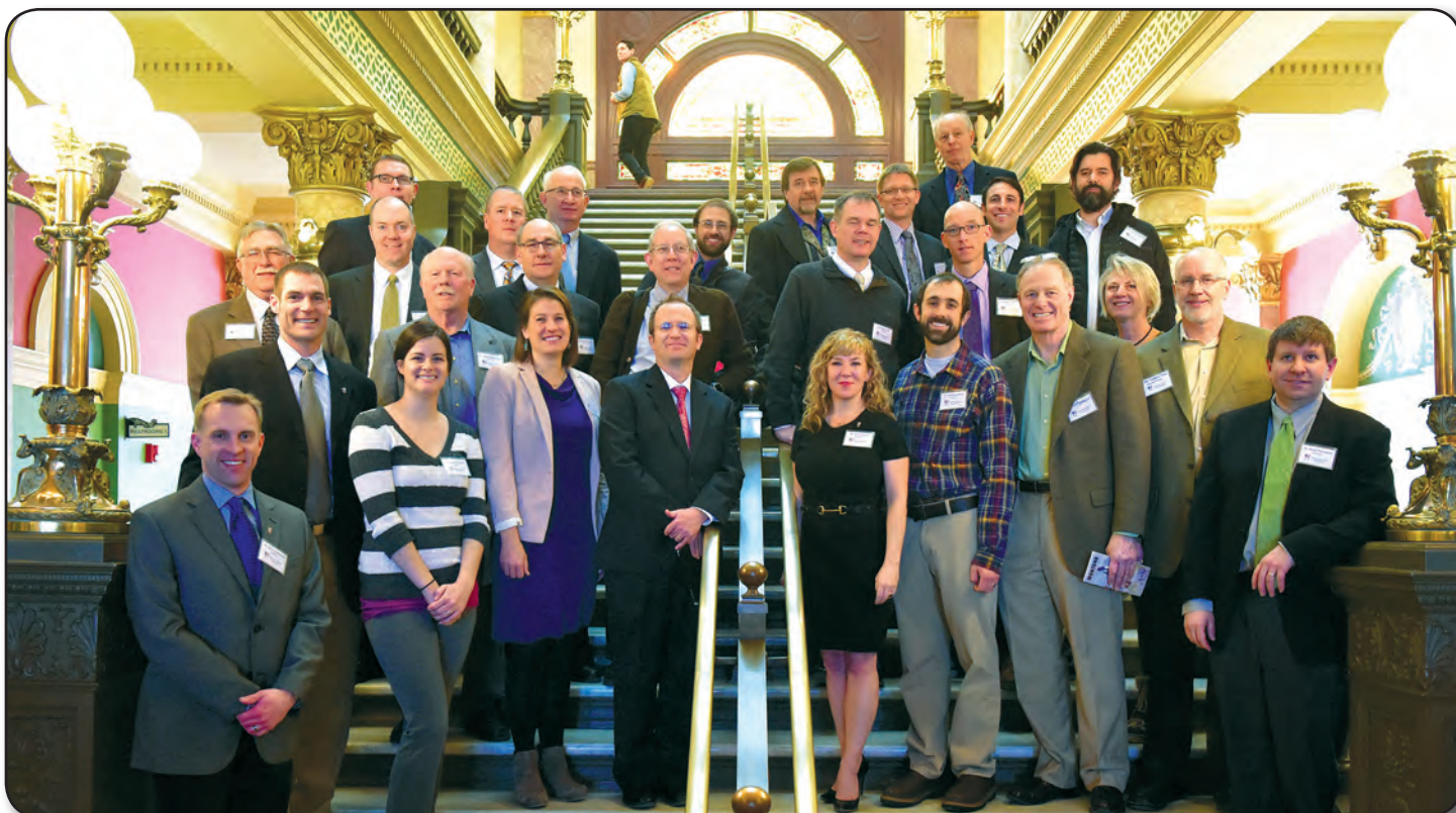
MDA dentists from across the state turned out in force to lobby legislators during the January 27 Dental Day at the Legislature.